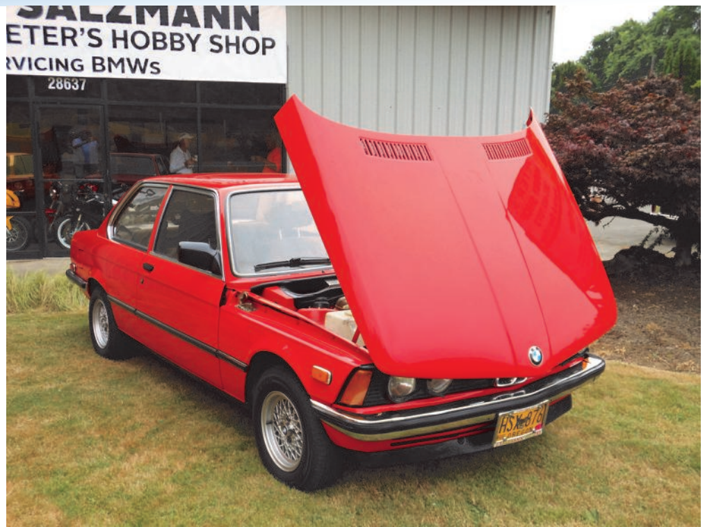
"New" kids on the block: the E21 (above) and E24 (below) are now bona fide Vintage SIG cars

We are looking forward to an even bigger year with even more events.