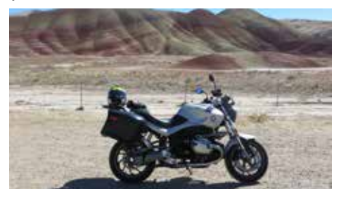
Hope to see you all (on 2 or 4 wheels) at club events this year.

The Media Team is working hard to improve and expand our chapter's media communications. We're excited to roll out new changes to our website, email, facebook, and instagram platforms.