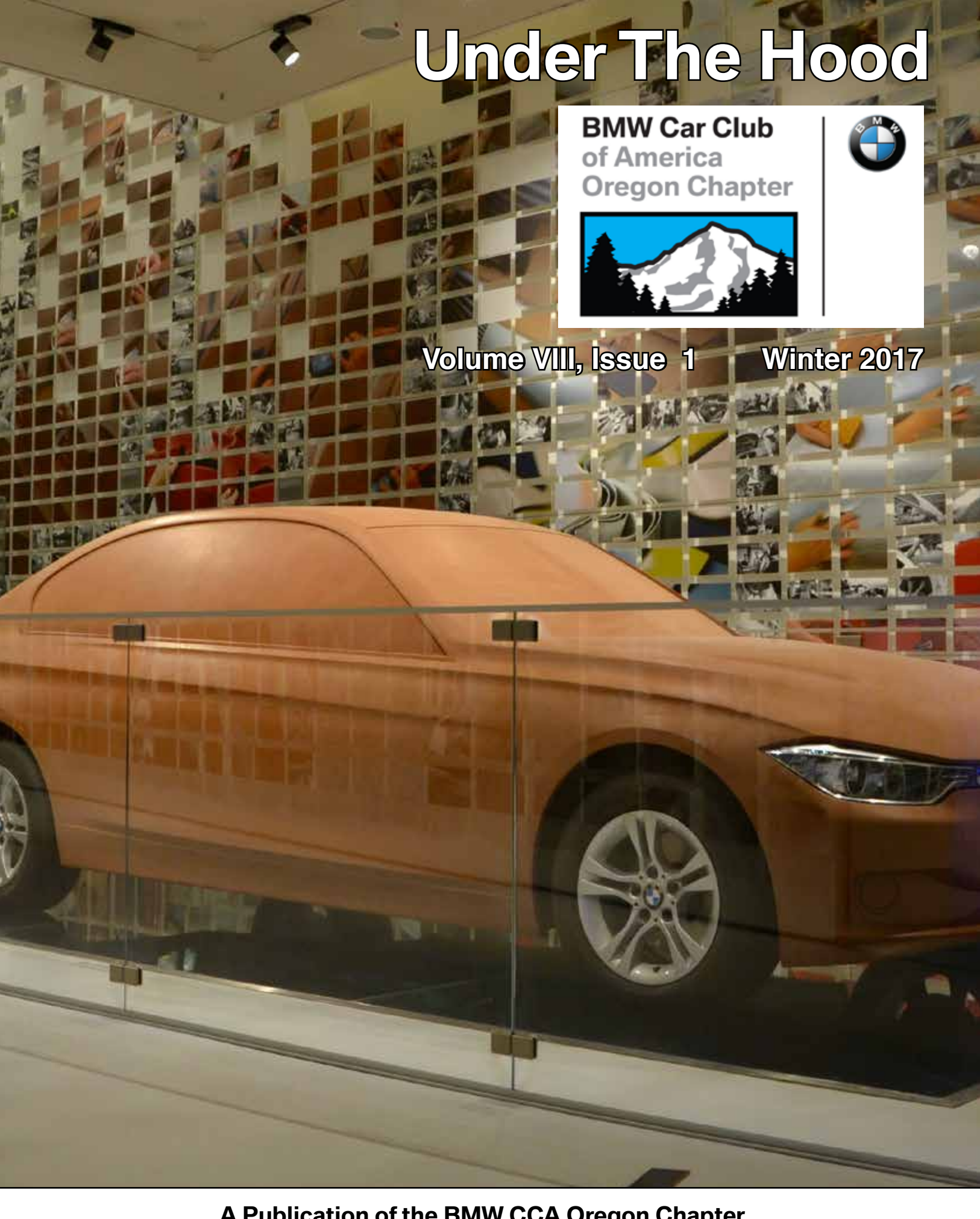
A Publication of the BMW CCA Oregon Chapter