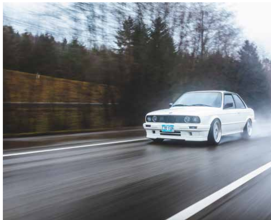
Heading to the Centralia Winter Edition by Tyler Um

New Members 3 6th Annual Anniversary Party 6 Club Car Spotlight: 1997 M3 8 Scouts Auto Maintenance Merit Badge Event 10 DIY at MBI Motors 11 BMW/PNW Centralia Winter Edition 12