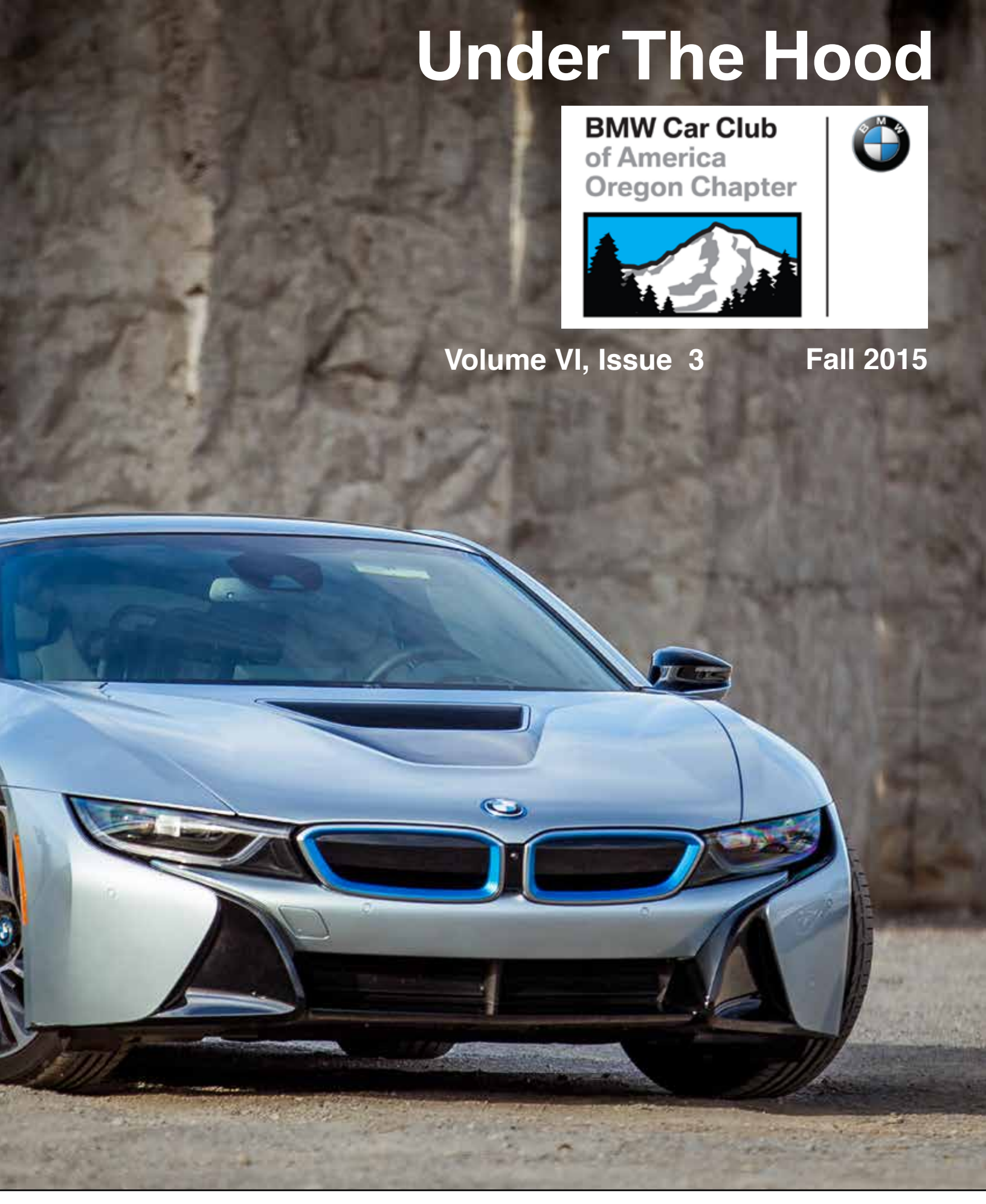
A Publication of the BMW CCA Oregon Chapter