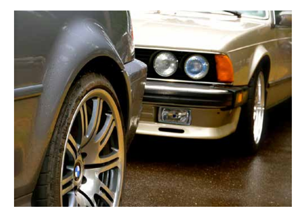
Northwest Ramble by Dan Hones